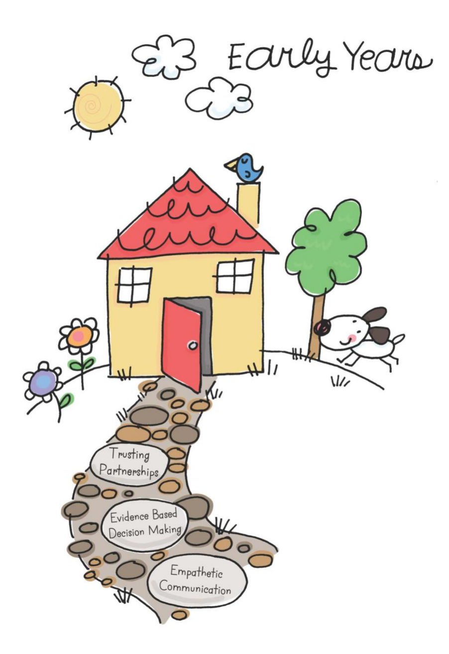
Figure 1: Kansas Early Years Pathway